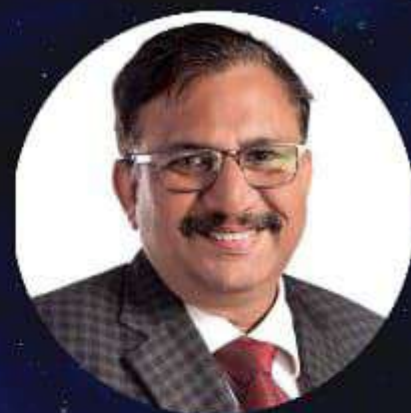
RAJESH GOGNA Senior Advocate in Supreme Court