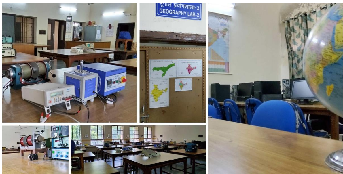
Figure: Well-equipped Physics and Geography Laboratory