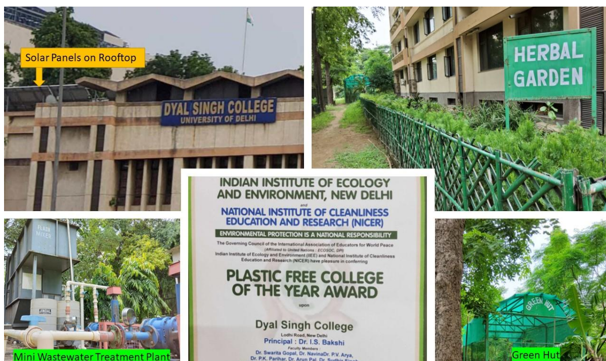
Figure: Green Initiatives and Plastic Free College of the Year Award