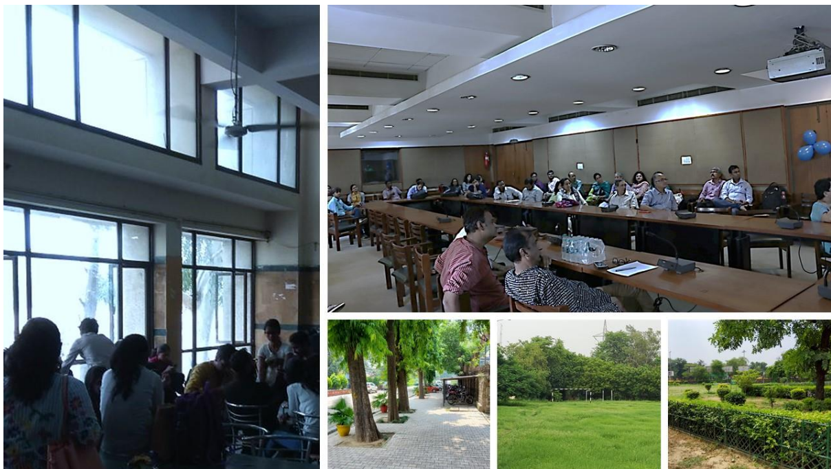
Figure: College Canteen, Seminar Hall, Parking facility, Football ground and College Lawn