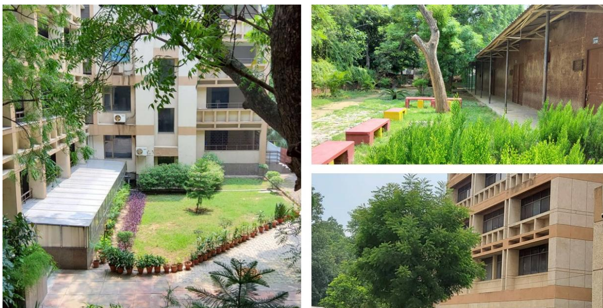
Figure: Classrooms in the lap of Nature