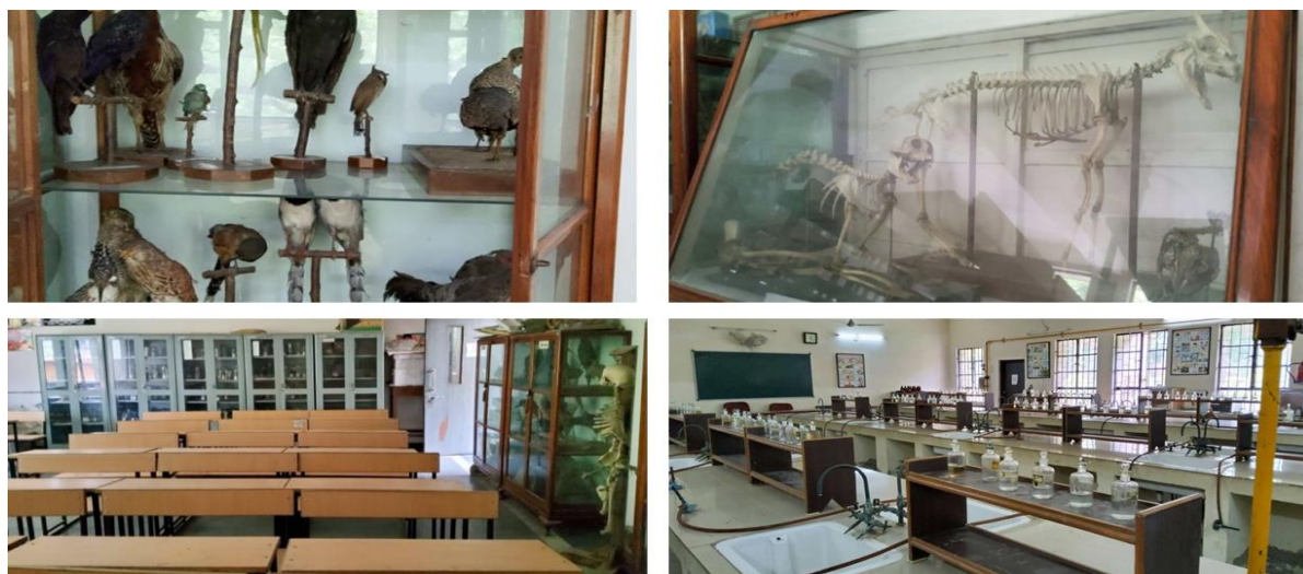
Figure: Well-equipped Zoology and Chemistry Laboratory