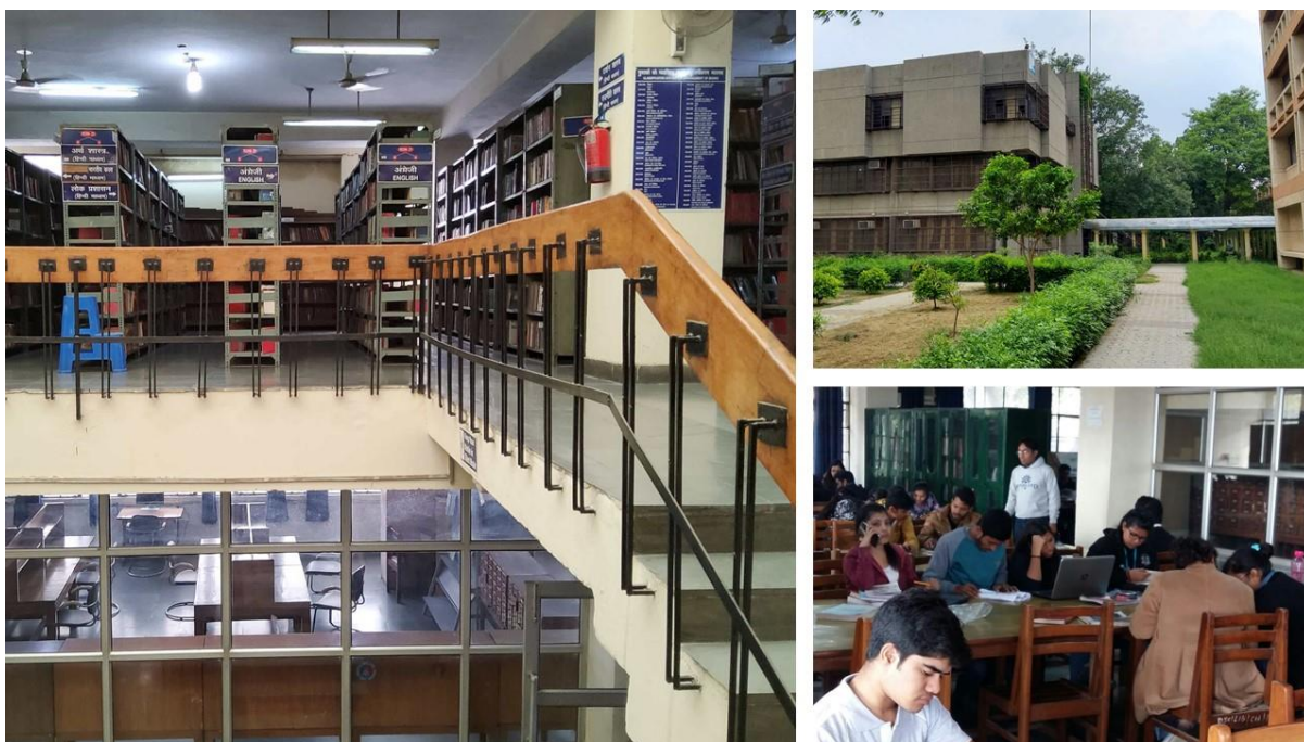
Figure: Dyal Singh College Library is also connected with D.U. Library System for E-resources.

The College campus is wi-fi enabled, and students have access to special software such as q-basic, Chemdraw, Treecon, Phylip, Phylodraw, Maxima, I c 3 and Mathematica. Faculty members are actively involved in research activities. Faculty has/is guiding over 48 students for the award of Ph.D. degree. Students are actively involved in Sports, Art & Culture, NCC, NSS & several other activities. A good number of students get an opportunity for internships & placements.