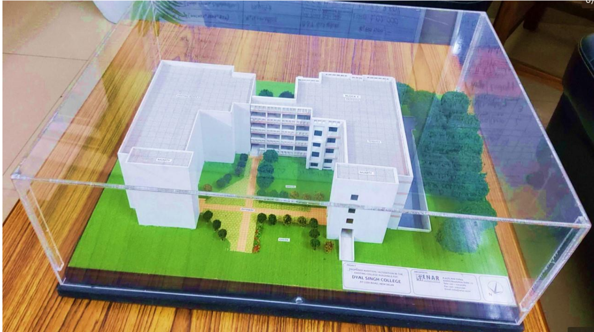
Figure: 5500 sqm Science Block Phase II Model